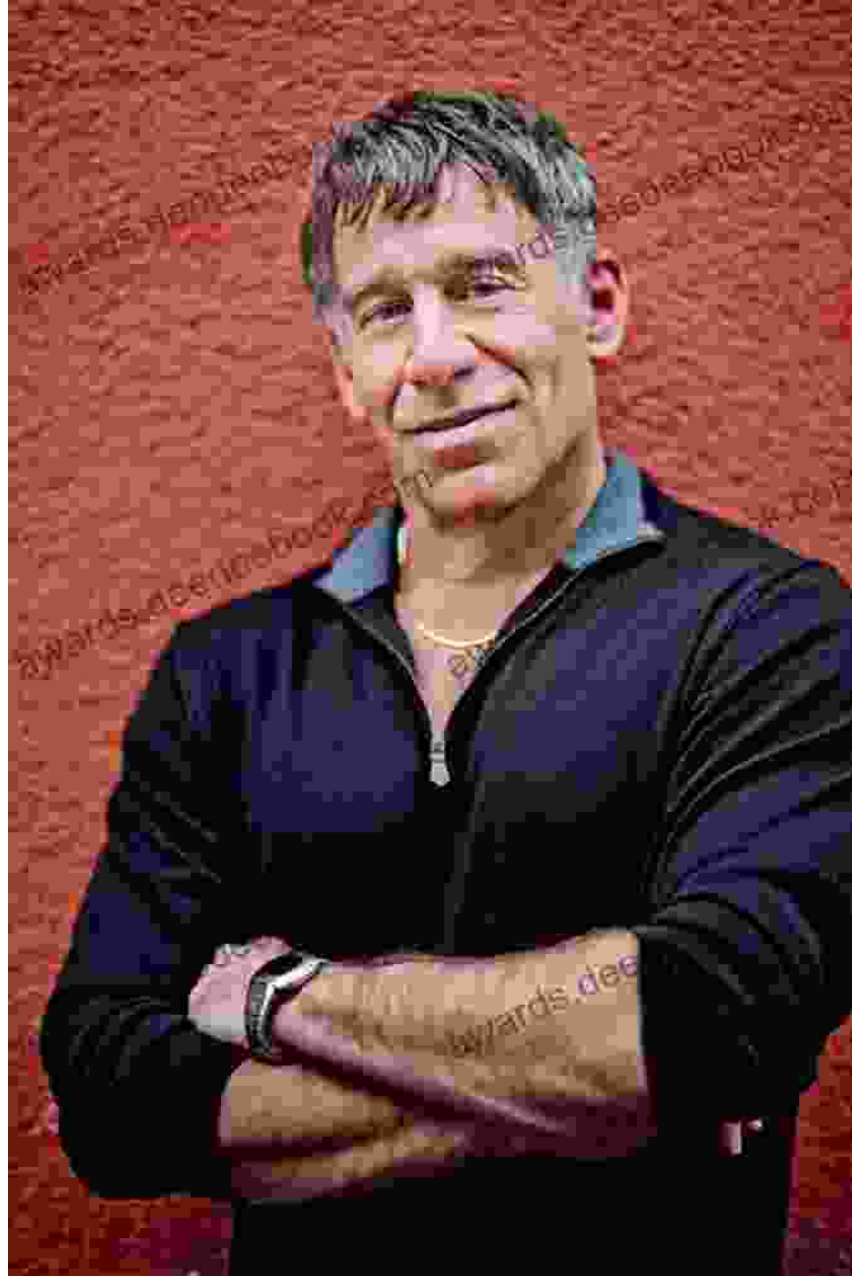
Stephen Schwartz in 2015.