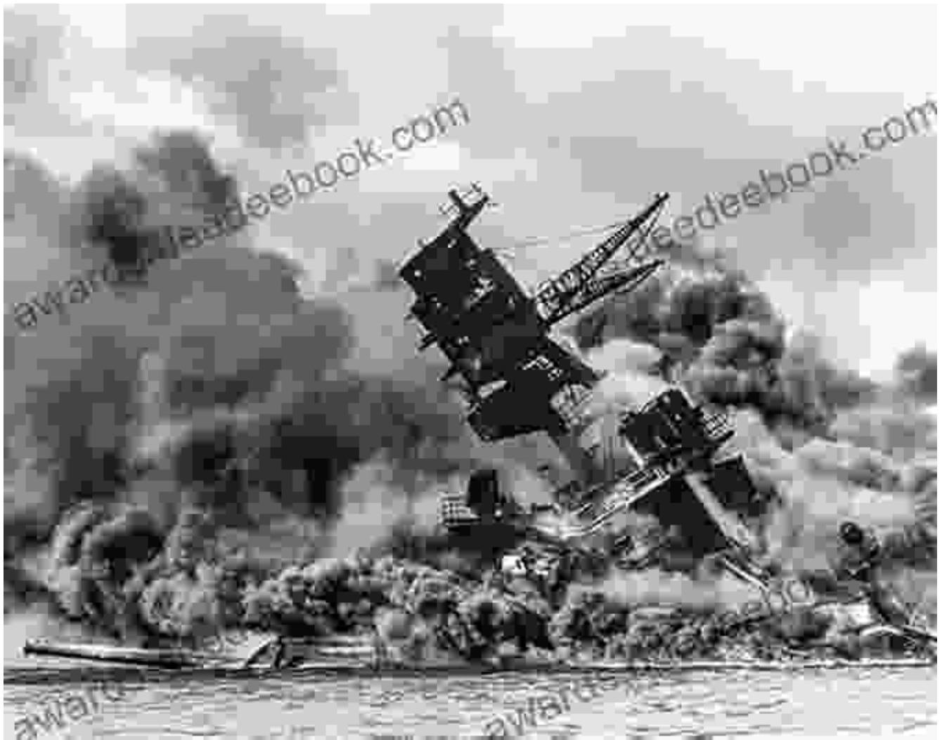
The USS Arizona sinking after the attack on Pearl Harbor