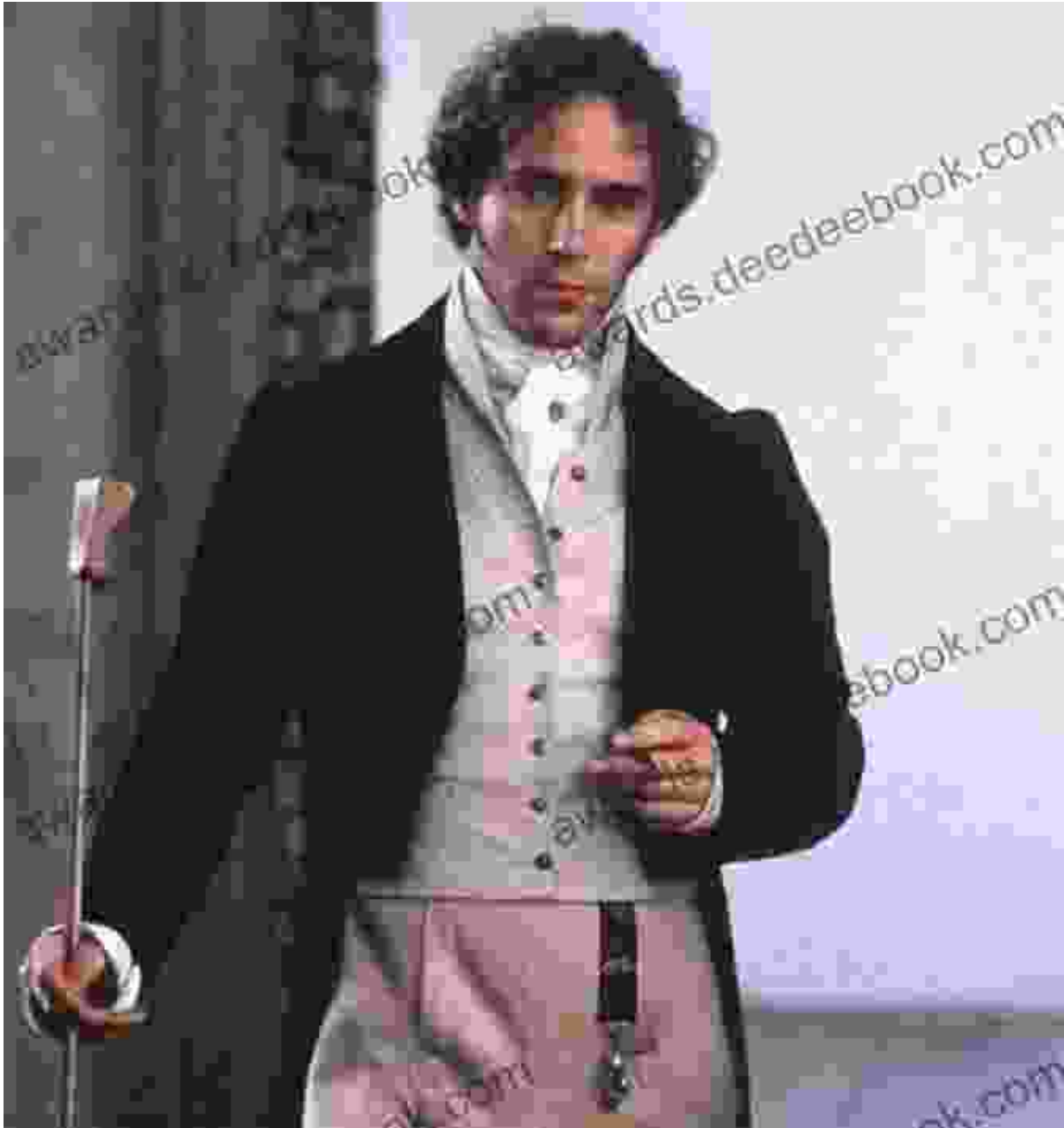
Henry Crawford, Mary's other suitor.