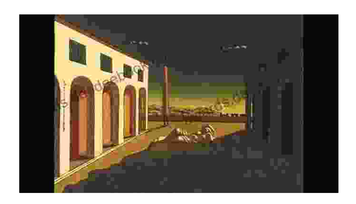
Bruno Schulz, Street in Autumn, 1936